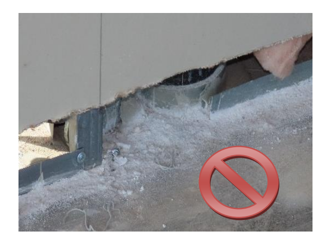
The systems were tested with a full flange installed... To stop the passage of fire & smoke